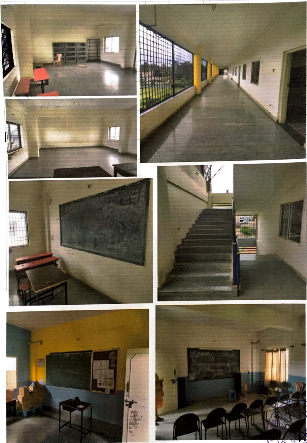
VIDYA SAMRAT INTERNATIONAL SCHOOL , Herohalli , Tunganagar Main Road, Vishwaneedam , Bydarahalli, Bengaluru -560091.